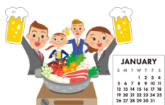
New year's party