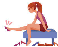
[the size] fit