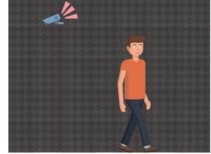
きえます [でんきが] kiemasu(denki ga) [a light] go off, disappear