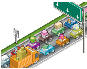
こみます [みちが] komimasu(michi ga) [a road] get crowded