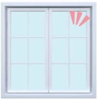
ガラス garasu glass (material)