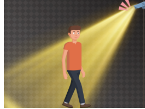
つきます [でんきが] tsukimasu(denki ga) [a light] come on