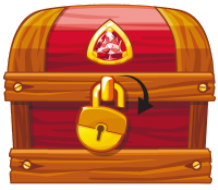
かかります [かぎが] kakarimasu(kagi ga) be locked