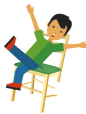
こわれます [いすが] kowaremasu(isu ga) [a chair] break