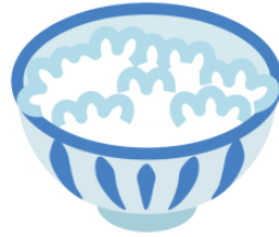
おちゃわん ochawan rice bowl