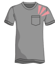
つきます [～が] tsukimasu(poketto ga) [a pocket] be attached