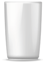
コップ koppu glass