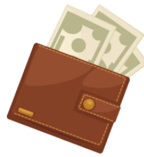
さいふ saifu wallet