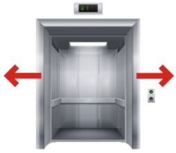
あきます [ドアが] akimasu(doa ga) [a door] open