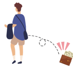
おとします otoshimasu drop, lose