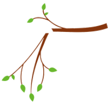
おれます [きが] oremasu(ki ga) [a tree] break, snap