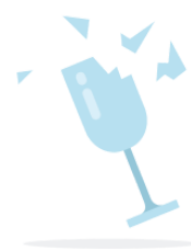
われます [コップが] waremasu(koppu ga) [a glass] break, smash