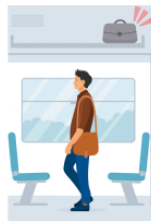
わすれもの wasuremono things left behind, lost property