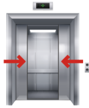
しまります [ドアが] shimarimasu(doa ga) [a door] close, shut