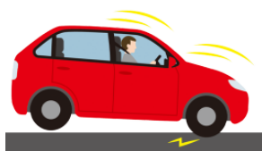
とまります [～が] tomarimasu(kuruma ga) [a car] stop