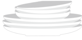
(お)さら (o)sara plate, dish