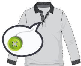
はずれます [～が] hazuremasu(botan ga) [a button] come off