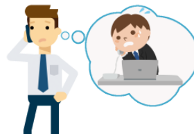
まちがえます machigaemasu make a mistake