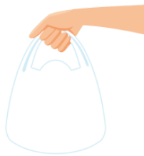
ふくろ fukuro bag