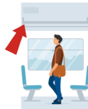
あみだな amidana baggage rack