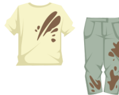
よごれます [ふくが] yogoremasu(fuku ga) [the clothes] get dirty