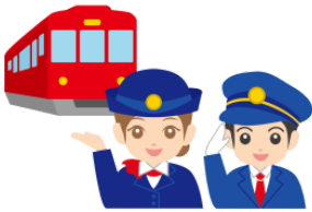
えきいん ekīn station employee